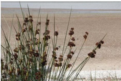
Juncus acutus – needle rush, extremely sharp ends to the stalks. Growing along the waterfront, but distinguish it from other softer rushes