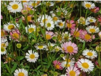
Erigeron Mexican daisy. Currently growing on cliff faces in Takahoa Bay.