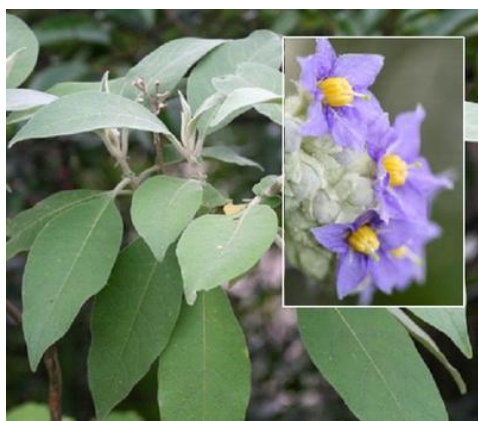
Woolly nightshade . Shade tolerant, so is appearing within the forest remnants (spread by birds) as well as in the open. Has a long fruiting season so eradicate on sight.