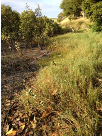
Shore Paspalum. Invasive inter-tidal grass.