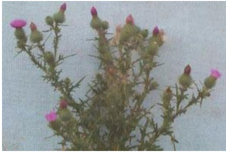
Scotch Thistle (has spines on leaf surface as well as edges)