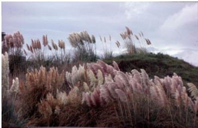
Pampas. Can tell it apart from toetoe by looking for single midrib (not multiple), curled dead leaves, autumn flowering (not summer)