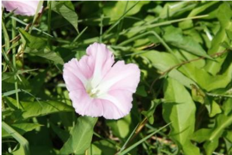
Calystegia sepium var roseata

Calystegia silvatica – great bindweed. This introduced vine has large white flowers. And large leaves. NOTE not yet present at TB but there are other native convolvulus species here which require discussion.