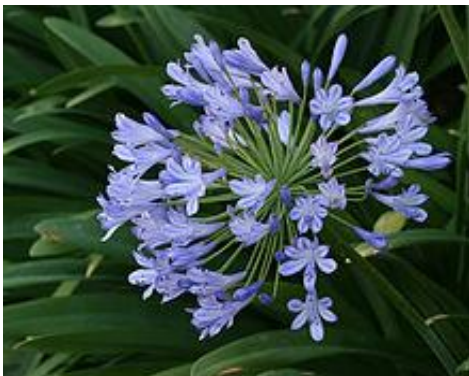
Agapanthus – near the homestead picnic site.