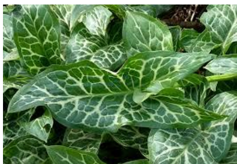
Arum italicum - arum lily with variegated leaf. Currently found in the covenant swamp.

If you see other invasive weeds appearing (especially if they are listed on NRC pest plant list) please alert the sub-committee and Kraig. Beyond our boundaries there are weeds such as cotoneaster and blackberry which could easily re-invade TBFP.