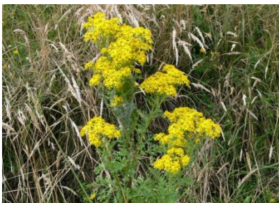
Senecio jacobaea Ragwort – an agricultural weed so we have a responsibility to eradicate the seed source on our Lots. Rosette of leaves first, followed by purple stems, then yellow flowers. Seed is wind distributed. There is another very common but smaller senecio called fireweed growing along roadsides and on bare ground, but it is not considered an agricultural weed like ragwort. It does not start life as a rosette.