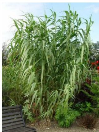
Arundo donax - giant reed , in covenant swamp and above homestead picnic area. We are getting assistance from NREC/DOC on this one. Summer control.